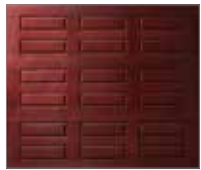
Horizontal Raised Panel 7' high