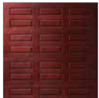
Horizontal Raised Panel 8' high