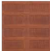
Sonoma Panel 8' high