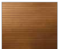
Horizontal V-Groove Panel 7' high