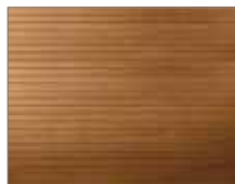
Horizontal V-Groove Panel 8' high

Larger sized doors are available (up to 14' high and 18' wide) depending on panel style.