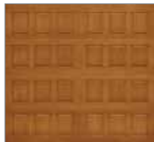
Vertical Raised Panel 8' high