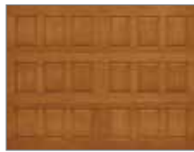
Vertical Raised Panel 7' high