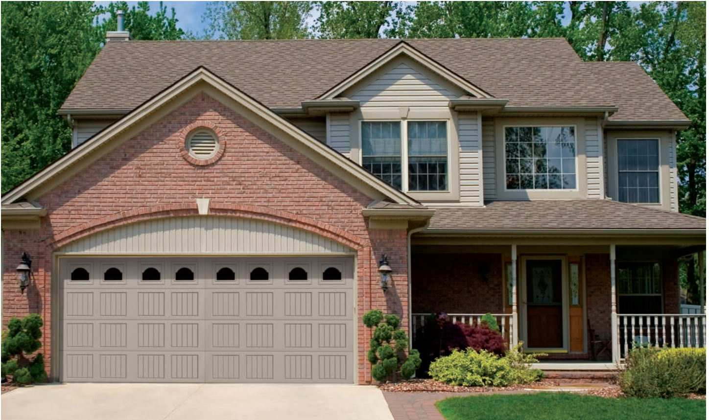
Model 9100 shown in Sonoma design with Cathedral I window inserts